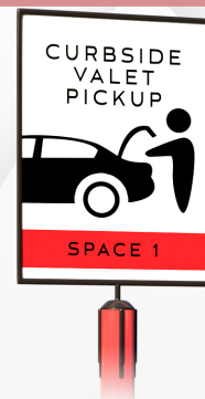
Valet Curbside Pickup

Valet Curbside Pickup is a complete system that combines cutting edge technology with outdoor pickup stations. It's everything your store or restaurant needs. Get set up within minutes.