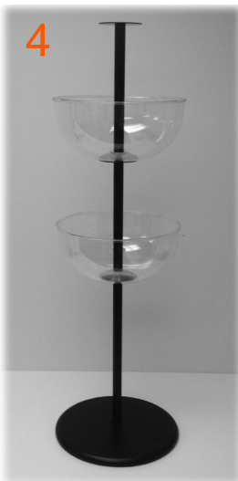
4 Repeat Steps 2 & 3 to add the second Bowl