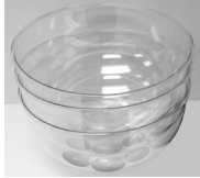
Bowls x 3