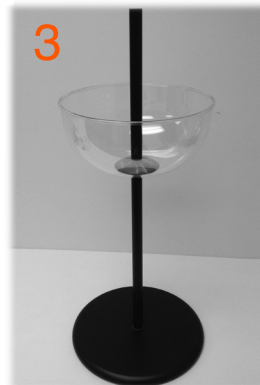
3 Place a Bowl onto the Support Plate and attached Bowl Rod by screwing in a Bowl Rod