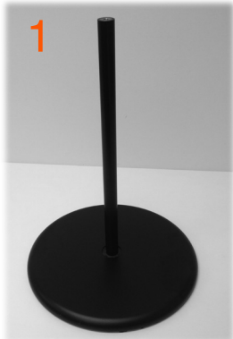
1 Screw Base Rod into the base, ensure Rod is tight