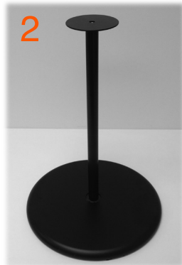
2 Place Support Plate on top of the Base Rod