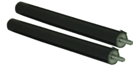
Bowl Rods (labeled B) x 2